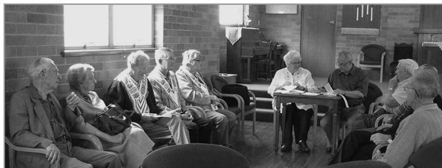
State Officers and Members at Newcastle Tent Meeting.

A delicious Christmas afternoon tea was served after the meeting. It's always a pleasure to visit Newcastle Tent. ■