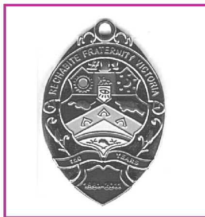
150th Anniversary Medallion

Everyone agreed that the special medallion struck is really lovely and looks very nice on the dark blue lanyard. It is something that will be treasured for many years to come.