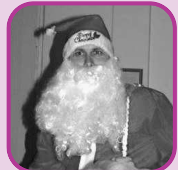
The Man in Red!