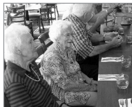
"Here we sit like birds in the . . ."