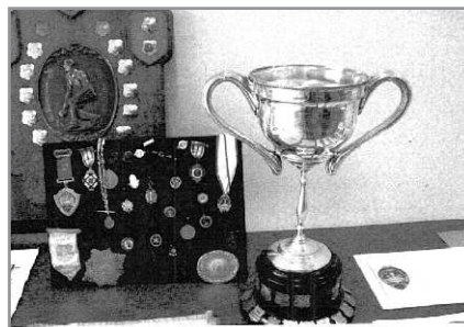
Part of the Memorabilia Display

We now look forward to what the future holds for IOR in Victoria and indeed in Australia. We must think positively for the future because who knows what it will bring. ■