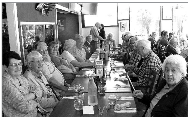
Awaiting our meals at Jacob's Well Tavern